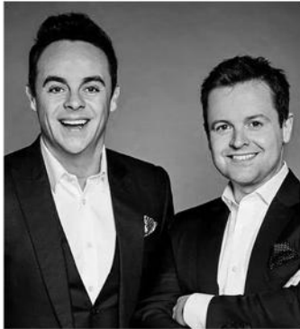
Ant & Dec

Supporting the Academy, we are extremely fortunate to have a group of patrons that are very active in their support of the college and the individual growth of our students.